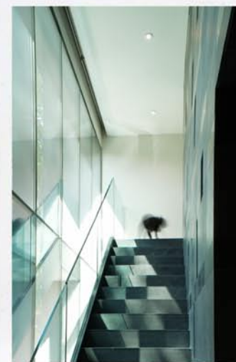
Far left, the facade is composed of black slate planes and a broad screen of tightly bound glass planks. Above, a green abstract wall of illumination in the living room. Left, the stairway runs straight up alongside a curtain wall.